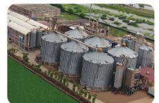
Matco Rice Plant Gujranwala, Punjab