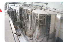
Matco Rice Glucose Plants Karachi, Sindh