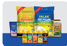
Matco Rice & Food Products Facilities Karachi, Sindh